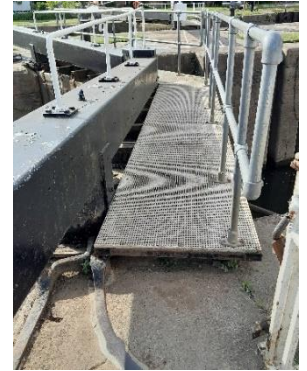
1 st lock gate

The step to the second lock gate is 205mm high.