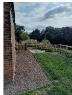
Route to weir viewing point