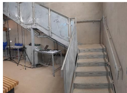
Viewing gallery staircase