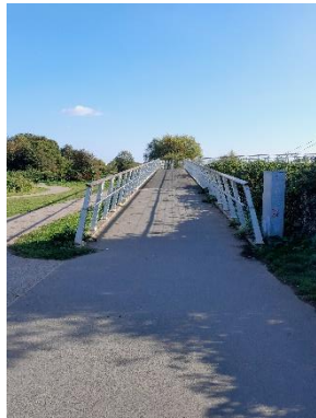
Diglis bridge approach

The walk to the fish pass and viewing gallery from the drop-off point is via an 830m walk along a tarmac public footpath and bridge, which forms part of the Sustrans network. On each side, the bridge can be accessed either by a gentle slope (as shown) or via 14 steps with a tread height of 145mm. The surface of the bridge is metal with a distinctive pattern. The footpath both sides of the bridge is level and flat.