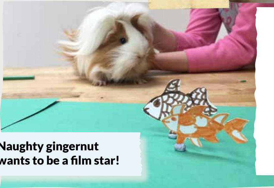
Naughty gingerbread nut wants to be a film star!