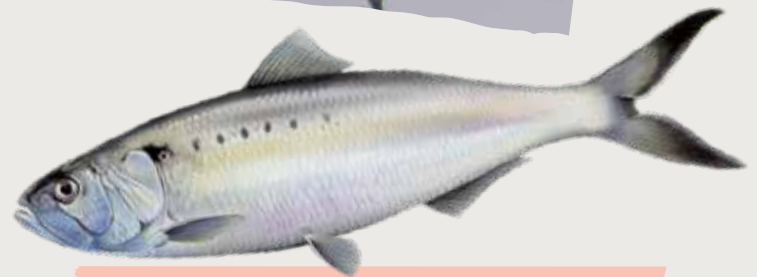
A beautiful twaite shad for inspiration