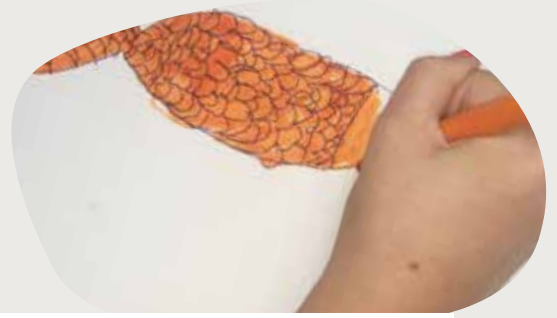
An introduction to Unlocking Fish Fun

An overview of the Unlocking Fish Fun activity video series: